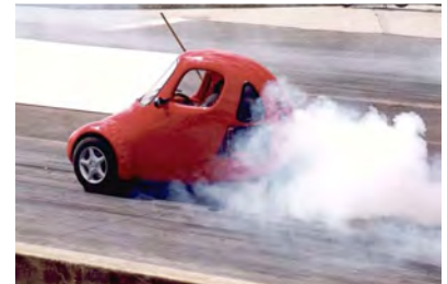
"The company was founded at the track"

For more information please go to http://www.alltraxinc.com